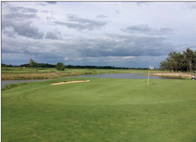
The par-3 feature hole 16th at Sobienie Krolewskie.