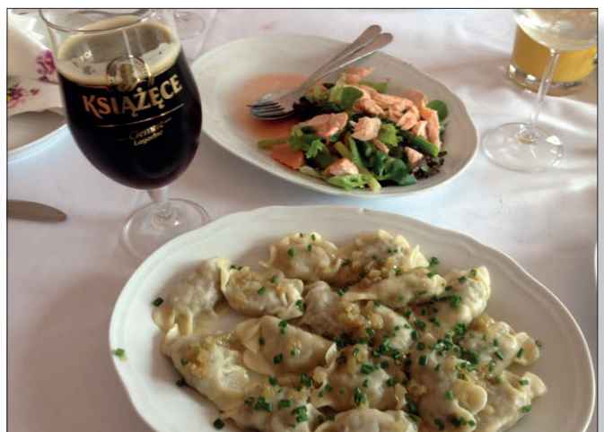
Dumplings and Ksiazecze local beer.