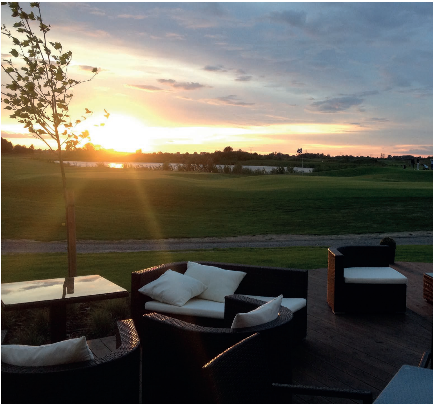
A stunning sunset over the 18th at Sobienie Krolewskie