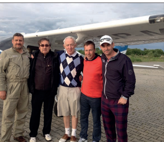
with some of the Irish press group.

Our accommodation that night was at a nearby four star hotel, which is a sister hotel to the golf course. Sobienie Kroleswkie Hotel is an exquisite 19 th century palace hotel where guests can relax and enjoy a luxurious meal in the restaurant, horse riding, tennis, swimming pool or the Wellness Spa.