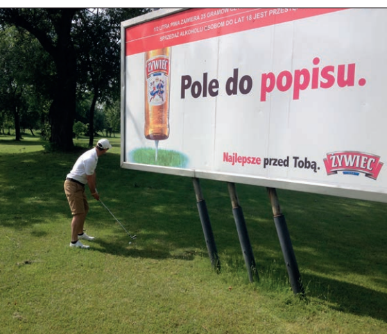
get a full swing beside the large billboard.

Later that evening we visited the Praga district, one of the coolest, most bohemian places to eat and drink in Poland. We were there to visit the very popular Warszawa Wschodnia restaurant at the SoHo factory. The open plan restaurant gives you a unique opportunity to watch some of Poland's finest chefs in action, creating typically Polish cuisine to whet your appetite. I chose the mouth-watering Deer medallions flambéed in French Armagnac brandy!!