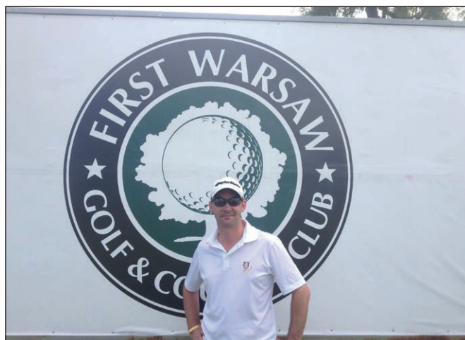
A snap beside one of the billboard signs on the course.