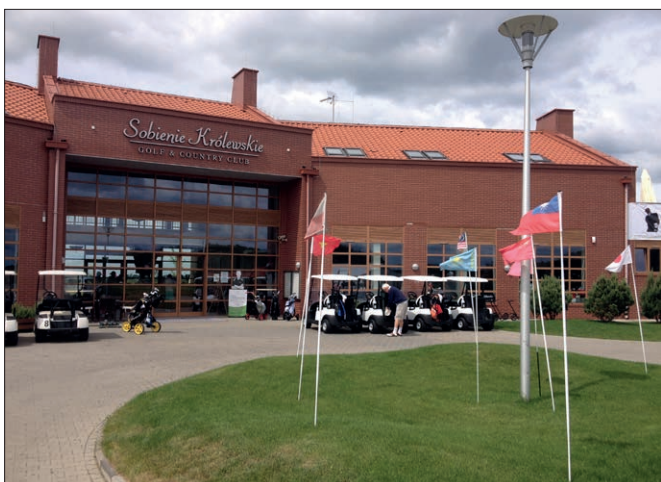
The large clubhouse at Sobienie Krolewskie.