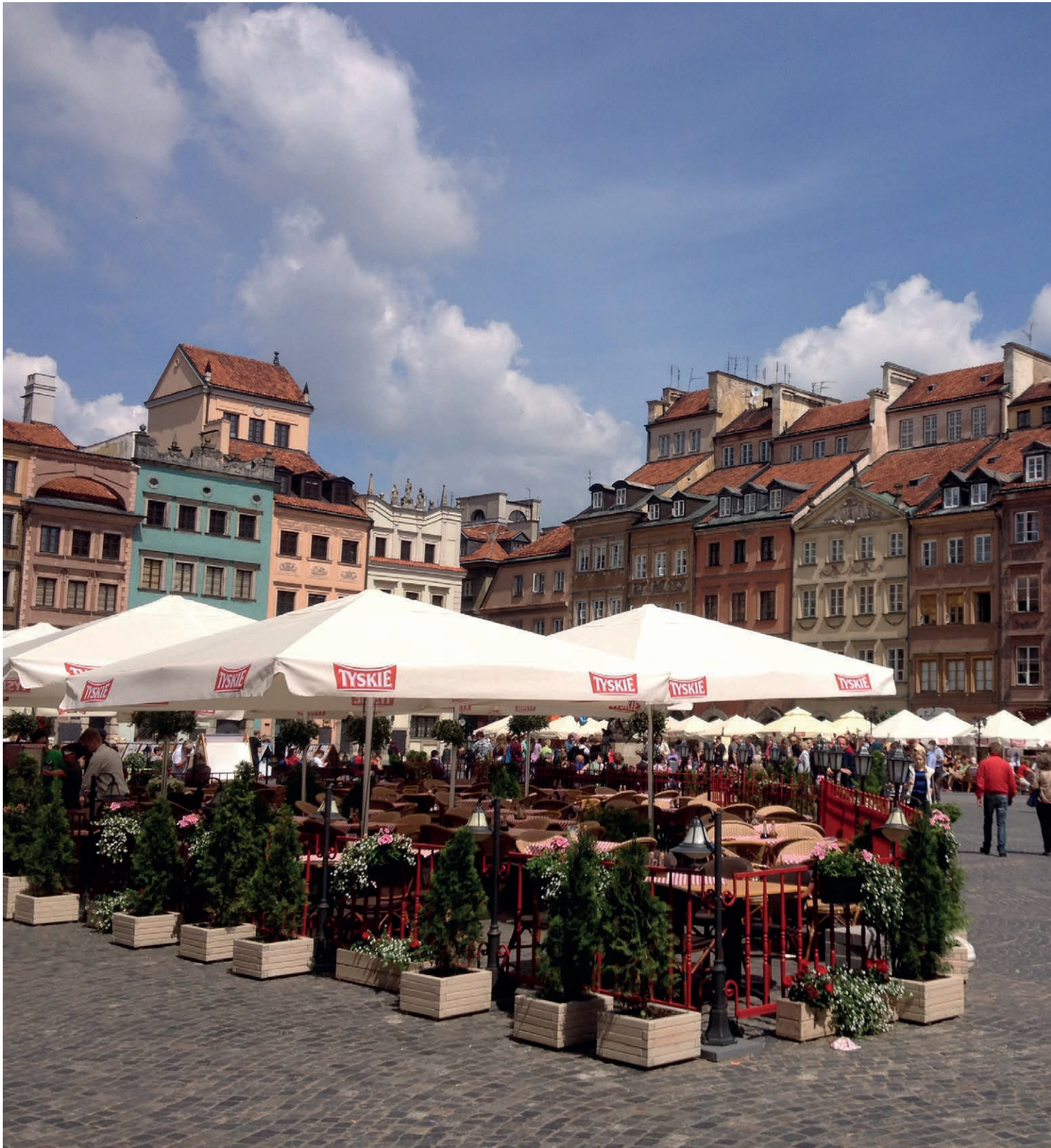
The Old Town Market Square, one of the most picturesque corners of Warsaw city.