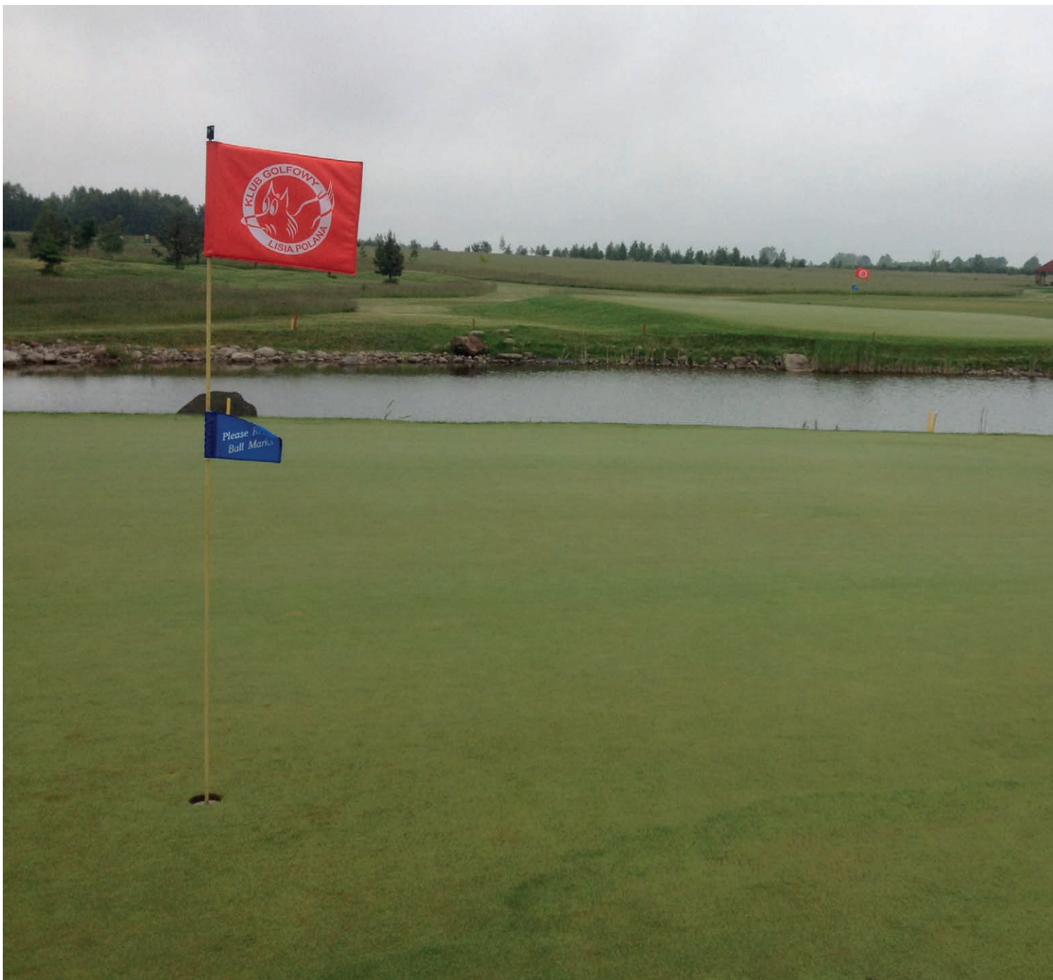
Golfing in the Polish countryside at Lisia Polana Golf Club.