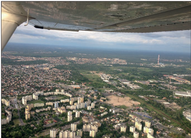
A birds eye view of Warsaw from above.