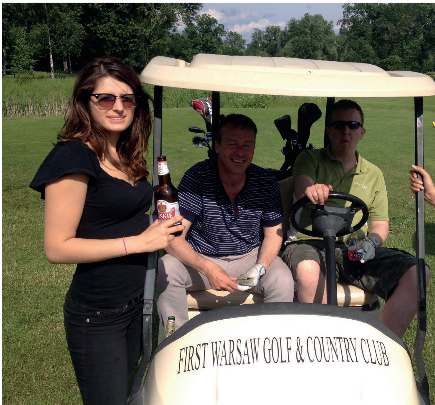
Beer cart girls hand out chilled Tyskie beers at First Warsaw Golf & Country Club.