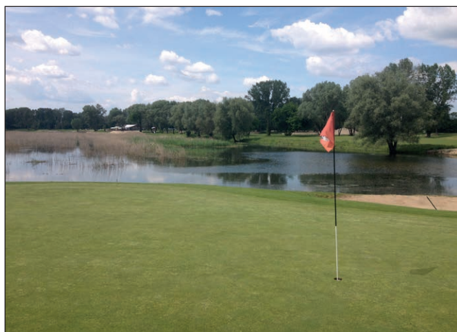
Lakeside setting at First Warsaw Golf & Country Club.